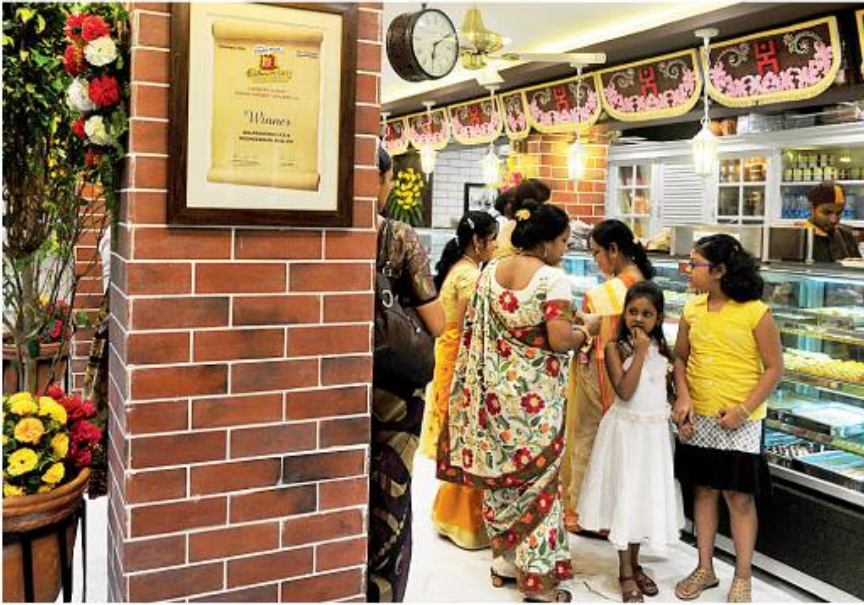
A glimpse of the latest Baram Mullick & Radharaman Mullick outlet on the Kasba-Ruby connector

I choke. I gasp for breath yet I refuse to give up. I lend a helping hand to all and I get love in return. I am, the City of Joy. I am the one and only Calcutta. Yours forever..." — That's the magic of Calcutta and guess where you can see these lines mounted on the wall? At 290 Rajdanga Main Road (beside Excise Bhavan on the Kasba-Ruby connector), a place known for its "Mishti Magic since 1885". That's where Baram Mullick & Radharaman Mullick, one of the best-known mishti makers in town, opened their brand new outlet on Saturday.