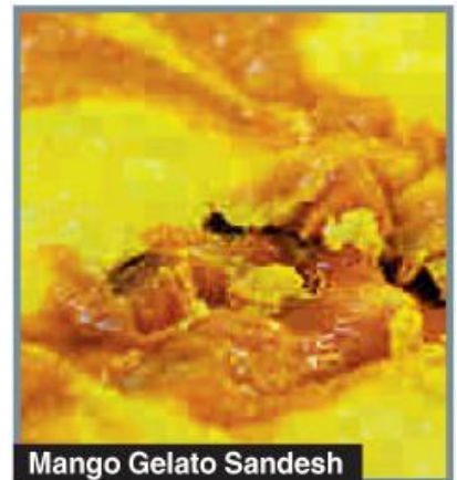
Mango Gelato Sandesh